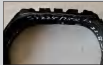
Full lines with 2-ply nylon cap